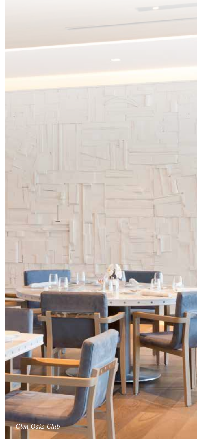
Glen Oaks Club

This is the signature of Pembroke & Ives. For nearly four decades, the firm has designed private residences for some of the world's most discerning clients. That residential depth is precisely what distinguishes the firm's approach in the club market today. The firm did not set out to become known for private clubs. The work evolved organically through longstanding relationships with the very individuals who shape these communities: members, founders, boards, and multi-generational families who had already entrusted Pembroke & Ives with their homes. Boards and ownership groups seeking a design partner found themselves returning to the firm that had already designed the residences of the very people who would use the space.