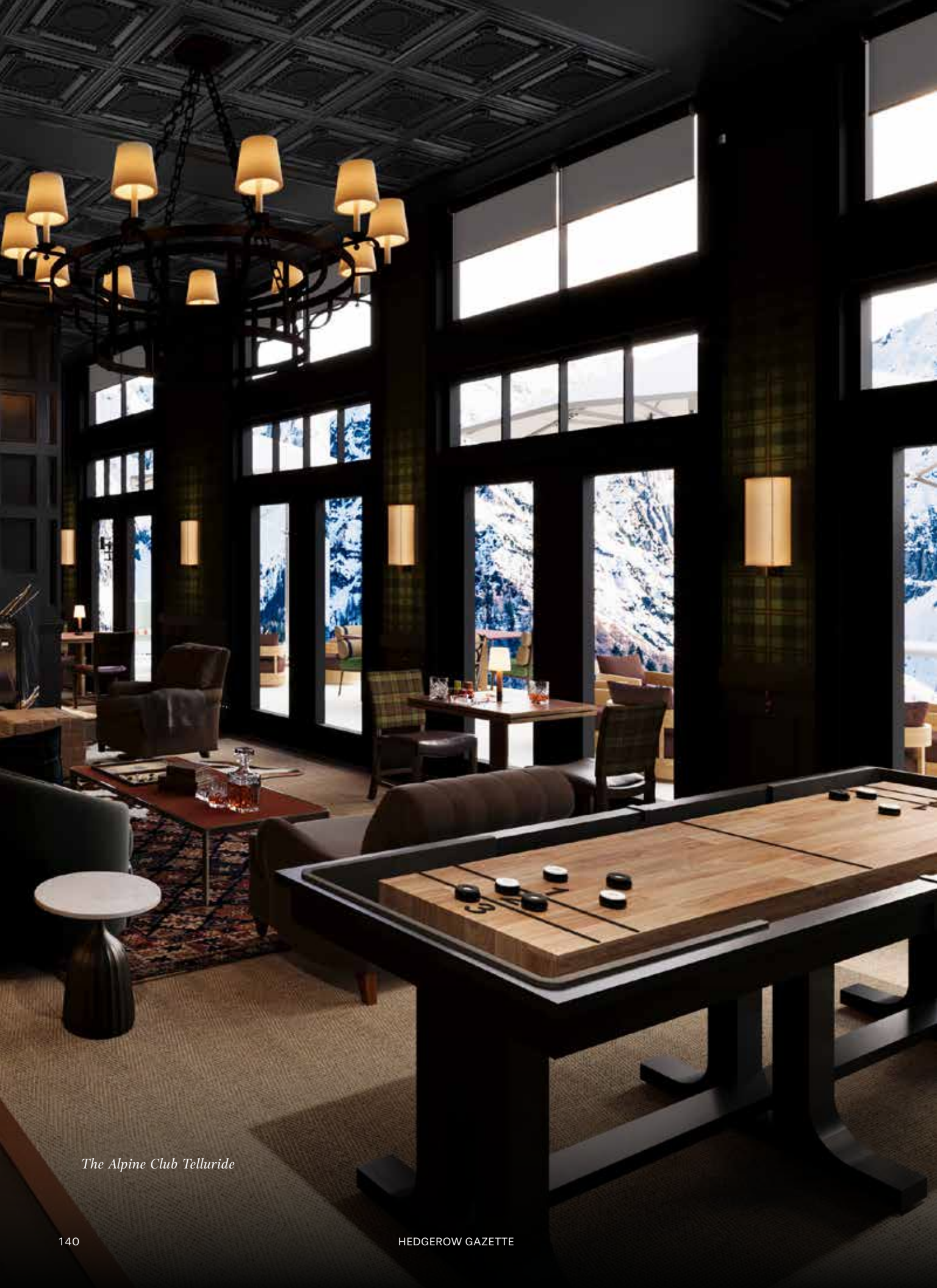
The Alpine Club Telluride

HOW PEMBROOKE & IVES HAS BECOME THE DEFINING VOICE OF THE PRIVATE CLUB