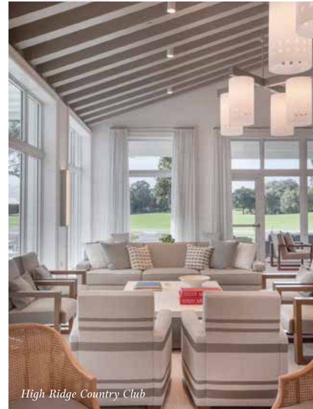
High Ridge Country Club