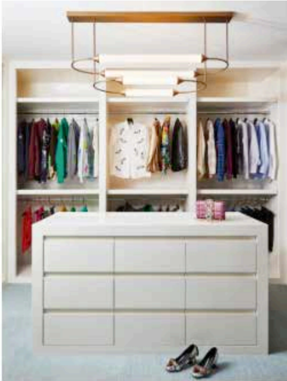
ABOVE In the wardrobe area is the Cirque Gradient chandelier by Giopato & Coombes from Studio Twentyseven