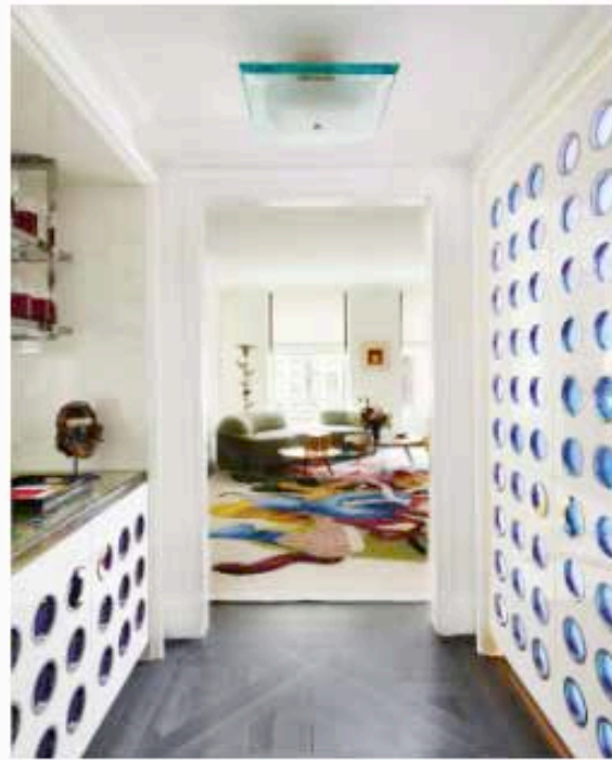
ABOVE The bar area features a fun perforated design on its custom cabinetry