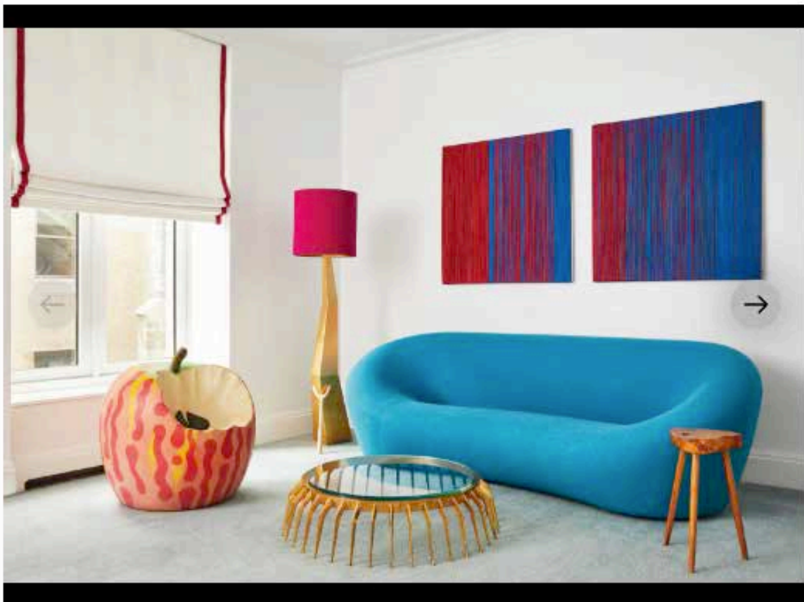
PHOTO 1 OF 3 The Mela Morsicata Apple chair by Studio 65 and a pair of paintings by Sheila Hicks are among the other eye-catching details in the master bedroom.

The same inventive design ethos permeates the private rooms, too. The master bedroom features another custom rug by Misha Kahn, and is complemented by a collectible quilt by Tracey Emin. In its lounge area, a Mela Morsicata Apple chair by Studio 65 sits alongside a floor lamp by Salvador Dali and a 1950 George Nakashima side table.